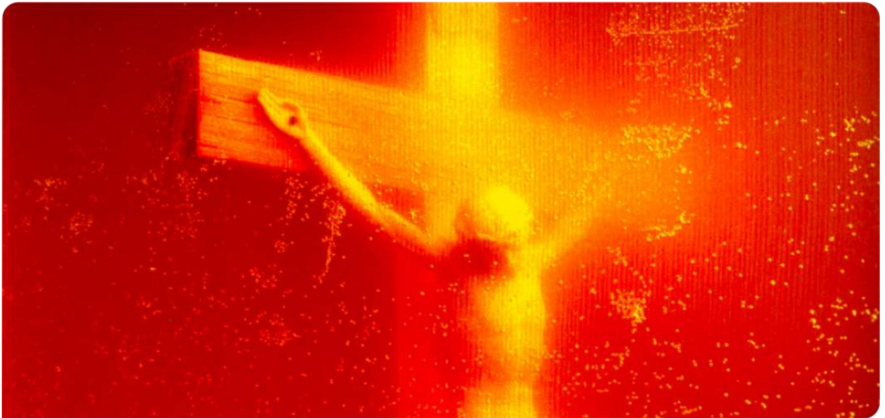
Andres Serrano, "Piss Christ" (1987)